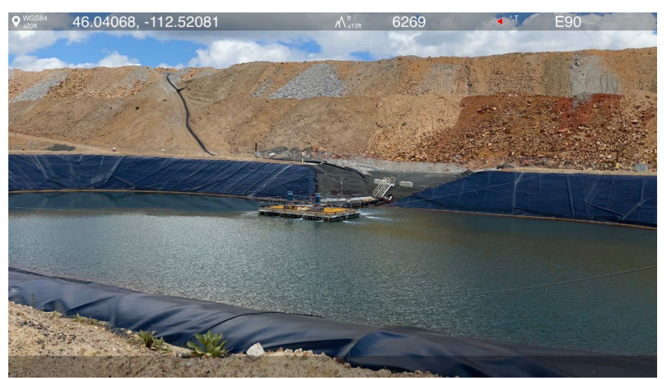
Photo 8- Compost is being stockpiled along a portion of the West Embankment, to be mixed with soil during concurrent reclamation.