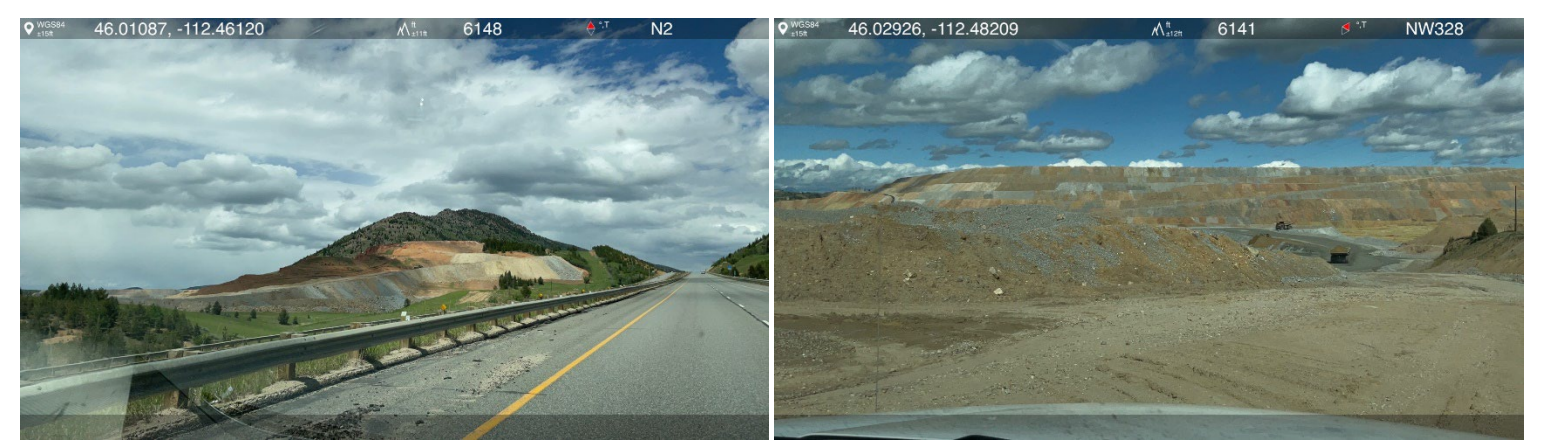
Photo 3- The backside of the highwall and soil salvage area in Photo 2 (from Interstate 15, northbound). Photo 4- Haul trucks moving non-ore rock, only small portions of the YDTI embankment crests have not been constructed to the 6,450 ft elevation. OP_Permits\00030_MONTANA RESOURCES\ENFORCEMENT-LEGAL\INSPECTION REPORTS\00030_2023_06_20_Inspect