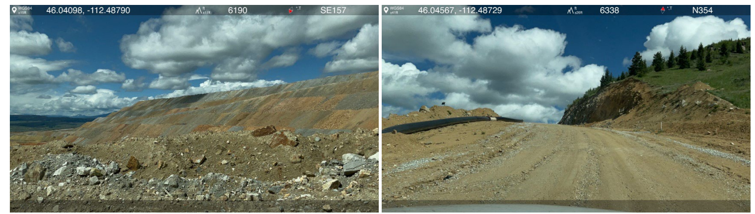
Photo 5- The primary haul route now follows along the ramp constructed on the N-S Embankment. Photo 6- The return water lines are functioning along the new barge access road (east side of YDTI), the former road will be decommissioned as the tailings and pond elevations rise.