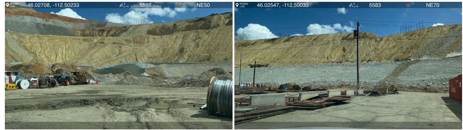
Photo 12- The 3-layer rock drains are being constructed on top of the foundation drainage layer, some portions have not yet been constructed. Photo 13- The foundation drainage layer continues to be constructed prior to placement of Pipestone drain rock.