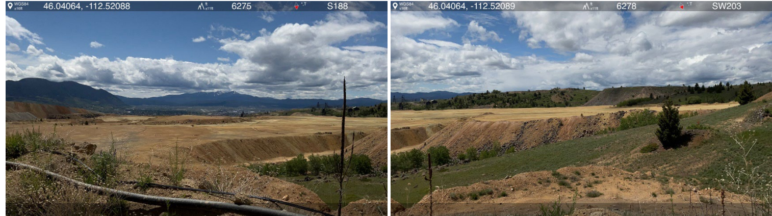
Photos 9 and 10- Looking south/southwest from the WED Extraction Pond area. The disturbed areas and flat waste rock are called the Northwest Dumps. MR is acquiring this land from Atlantic Richfield.