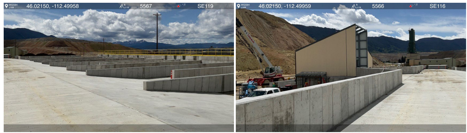
Photos 14 and 15- A new precipitation plant is being constructed to the south of HSB, near the HSB Water Treatment Plant. This facility was approved as revision MR 22-001.