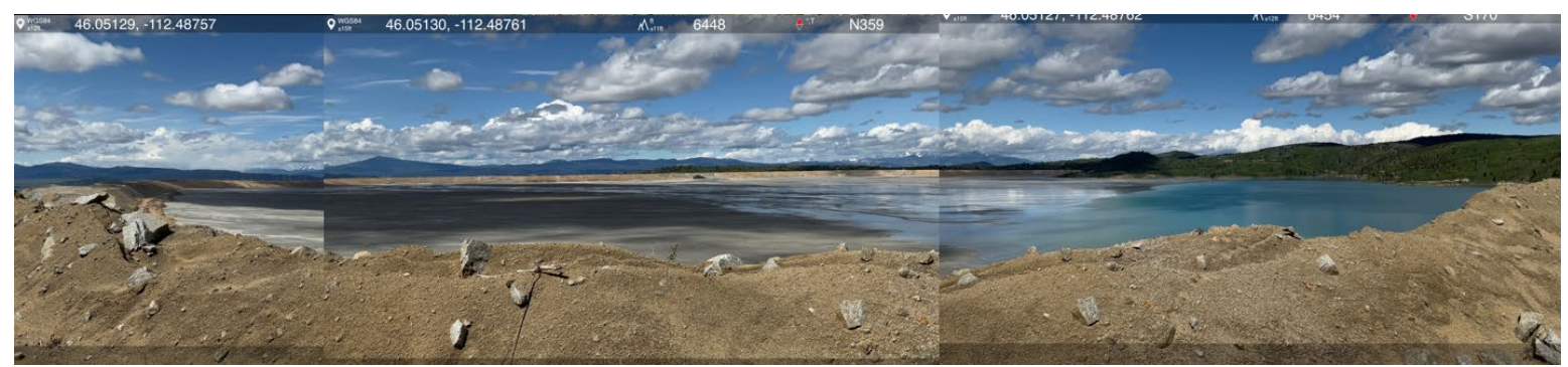
Photo 7- Additional tailings discharge lines allow greater flexibility for selectively applying tailings slurry in areas that might become dry and prone to blowing dust, and to control the uniform development of the beach and pond areas.