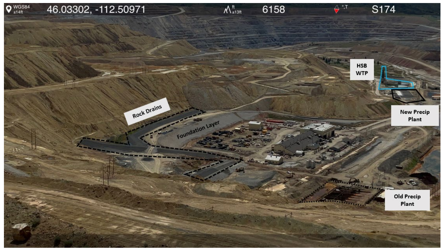
Photo 11- The HSB overlook near Tailings Booster Station #3, major features from the report are outlined and labeled.