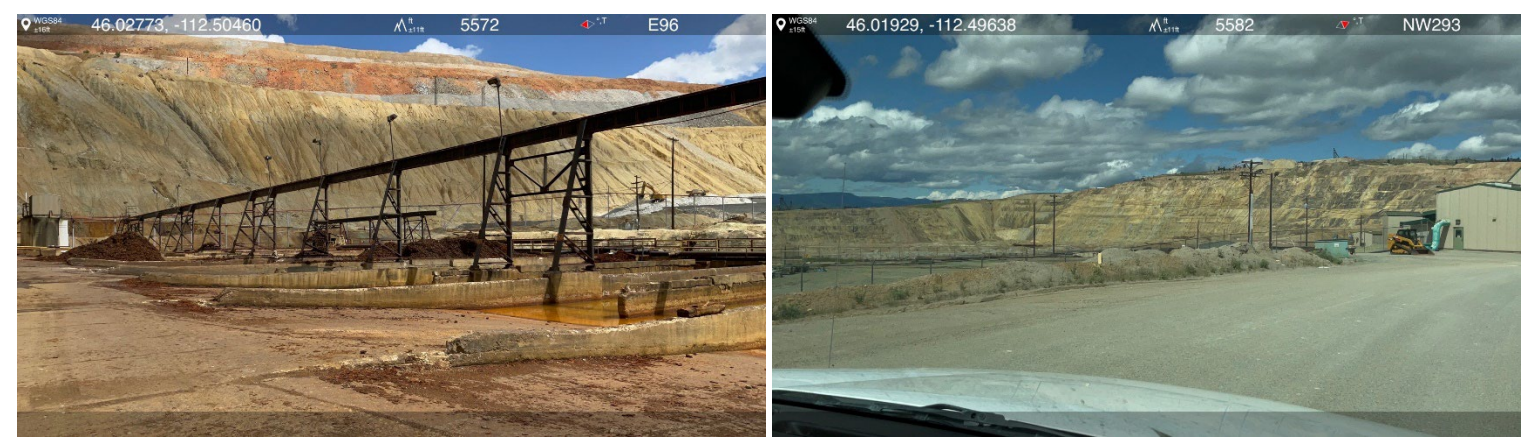
Photo 16 - The historical copper precipitation plant has been undergoing demolition in preparation for the RDS construction, though some portions of the plant are still operational at decreased capacity. Photo 17 - Pilot scale testing for REE/CM recovery may begin later in 2023, which would involve the placement of "geotubes" in a flat area adjacent to the current plant facility (inside fence, other side of road berm).